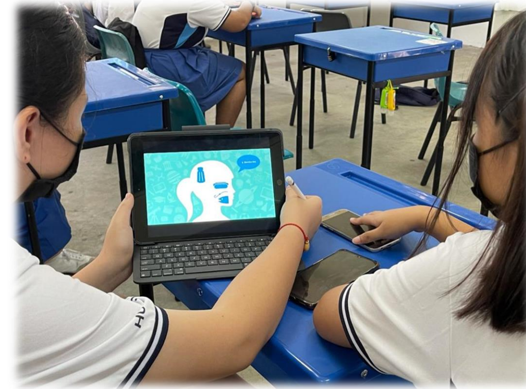
Support the Development of Digital Literacy

The use of the PLD for teaching and learning aims to: