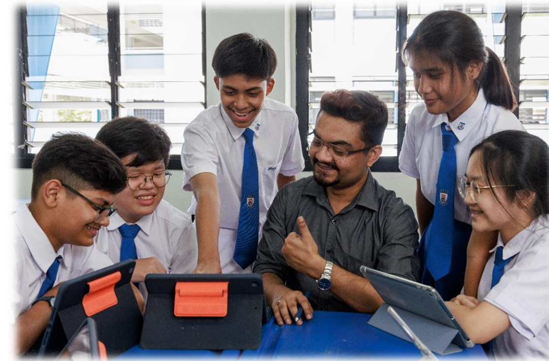
Support Self-Directed and Collaborative Learning