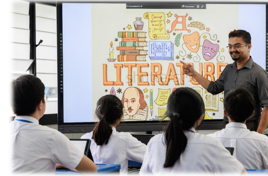
Enhance Teaching and Learning