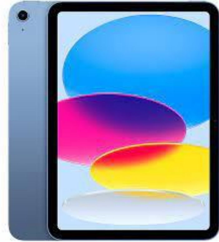
Apple 10 th Generation Apple Pencil Logitech Case